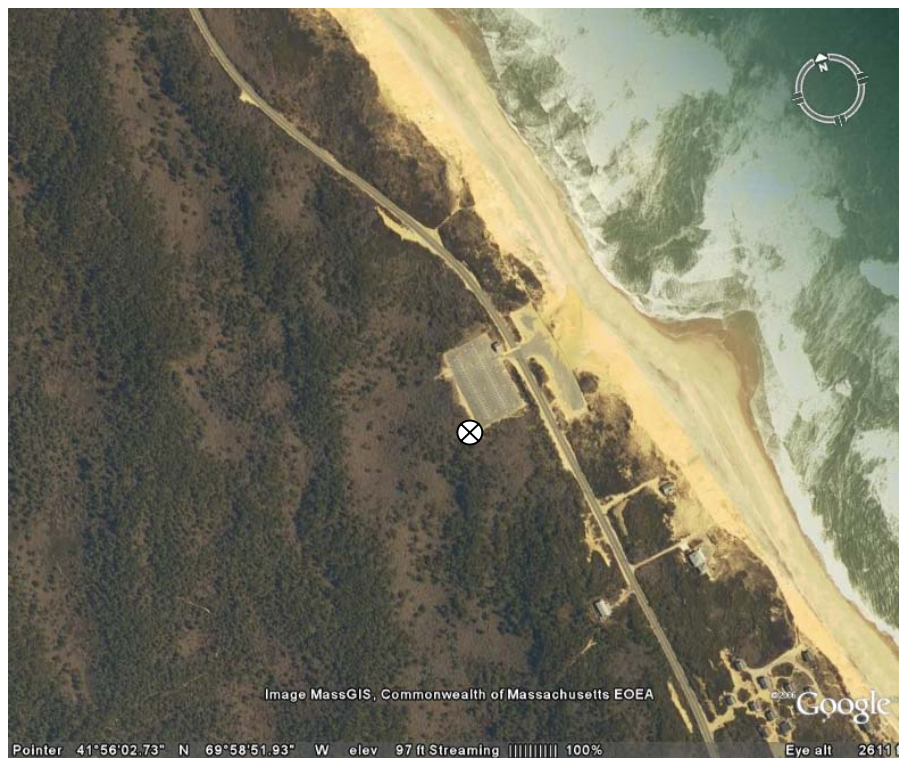
Figure 1 - Wellfleet Site Location

The site is located at a parking lot very near the beach on Ocean View Drive in Wellfleet. The site elevation is 29 m above sea level. The circle in Figure 1 shows the exact location of the tower. The location of the tower base is at 41.934°N, 69.980°W (WGS84/NAD83).